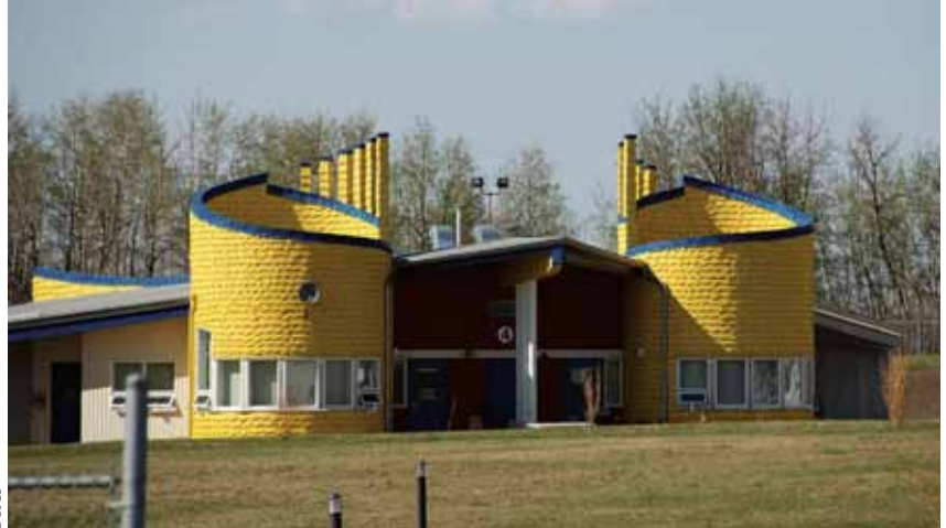
One of the many buildings within the Pê Sâkâstêw Centre, in Hobbema, Alberta, which is based on a Healing Lodge design model where offender accommodations are residential houses.

ago, there has been little in terms of effective measures to facilitate changes within the system. Rehabilitation and reintegration programming for Aboriginal peoples that would reduce recidivism is in most cases absent from the system. This can be attributed to lack of resources, which is interesting considering that if successful, the decrease in numbers within both the justice and corrections would essentially save the system resources overall. Also, after forty years of this issue being researched and identified,